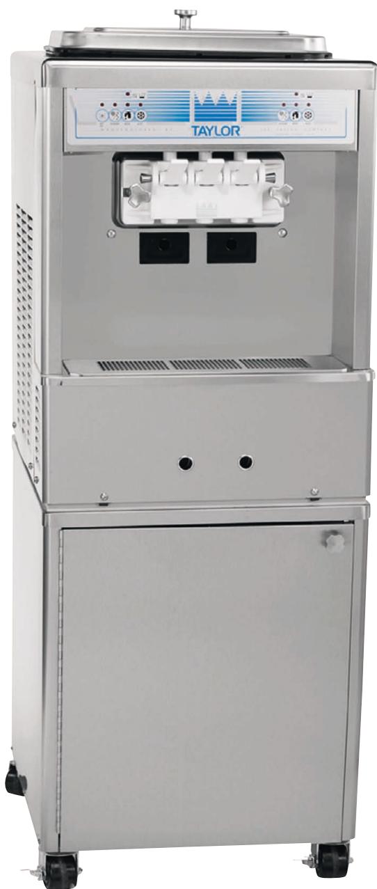
Photo shows Model 161 with optional cart