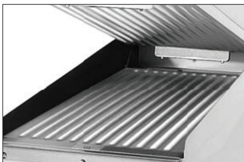
Optional grooved lower cooking surface and/or grooved upper platen