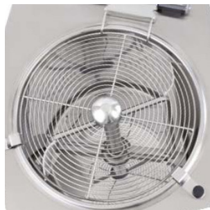
Safety grate allows lid to be opened