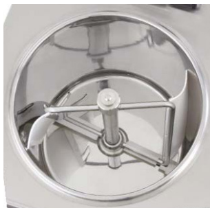
Beater with removable scrapers