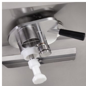
Door spout with dual

CHEF 60 LCD - Cream Cooker - 30 Kg to 55 Kg