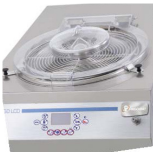
Vented transparent lid