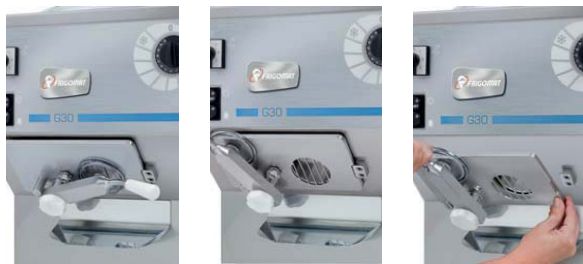
Freezer door; closed, open, and disassembled