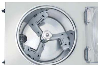
Freezing cylinder with beater and removable scrapers

PLEASE NOTE - Hourly production values are for guidance purposes only and does not constitute any guarantee. Actual production capacity is dependent on ambient working conditions and the type of product being frozen.