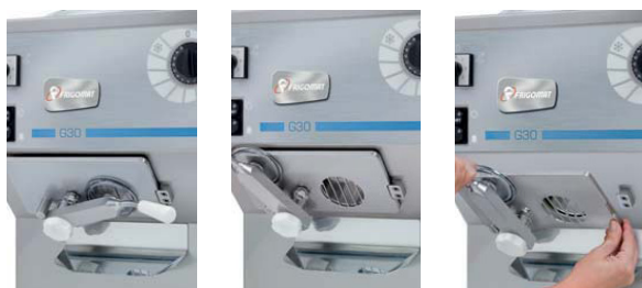
Freezer door; closed, open, and disassembled