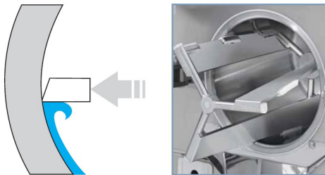
Beater with removable mobile scrapers

PLEASE NOTE - Hourly production values are for guidance purposes only and does not constitute any guarantee. Actual production capacity is dependent on ambient working conditions and the type of product being frozen.