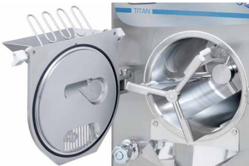
Stainless steel door with hinged safety grid