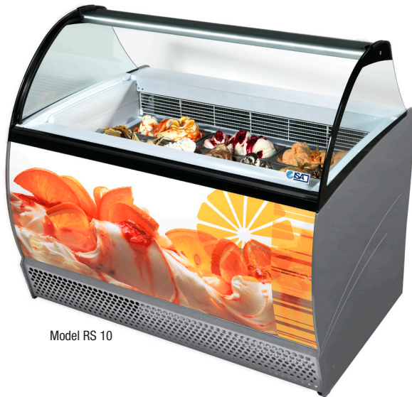
Model RS 10