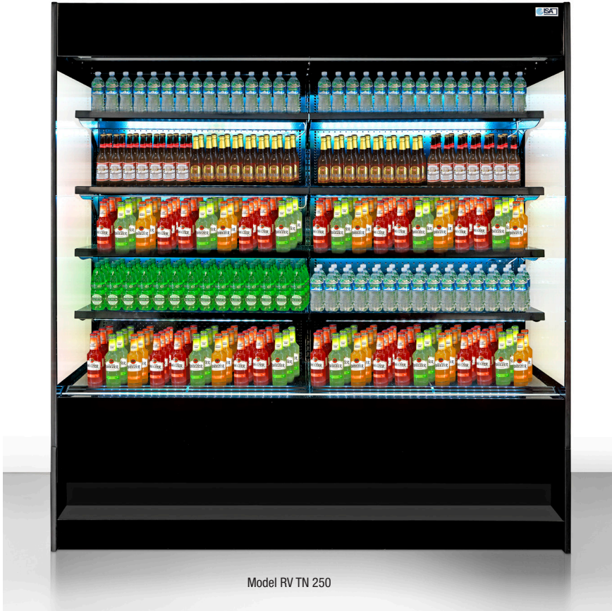
Model RV TN 250

Multideck display suitable for dairy products