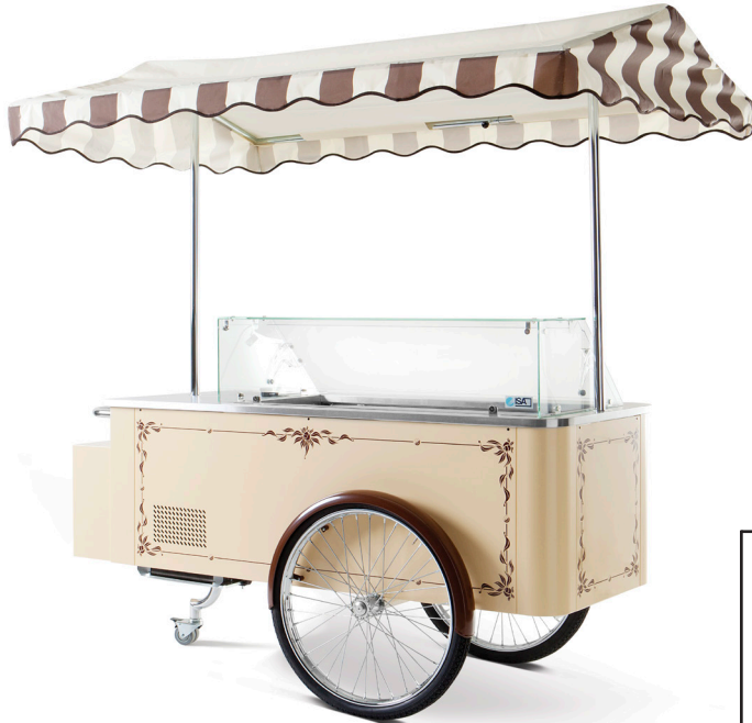
Model IL CARRETTINO CLASSIC - YELLOW