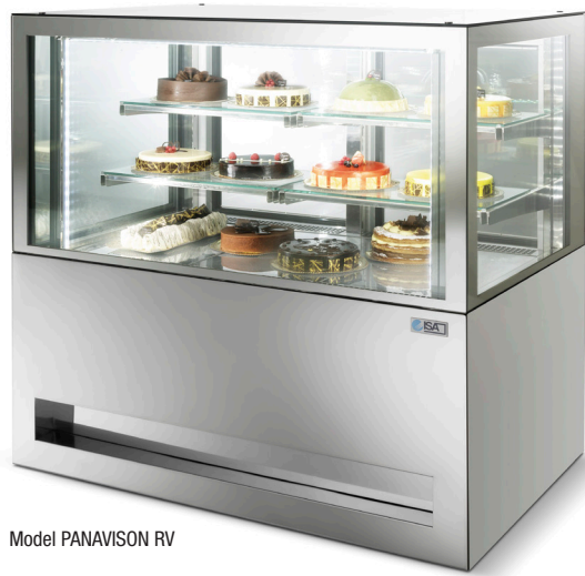
Model PANAVISION RV