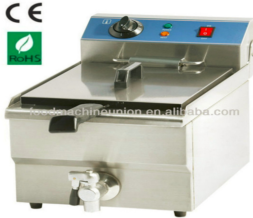
QUALITIFRY model and Traditional Fryer model

The scope of the work is to measure the power consumptions obtained in the different tests carried out with the two fryers object of the study and then to establish a comparison between them.