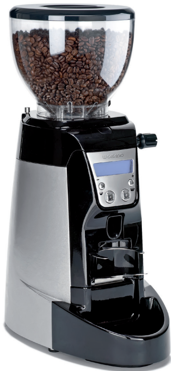
CASADIO ENEA GRINDER-DOSER