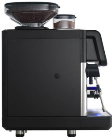
(S20-CS10 shown with optional standard steam wand)