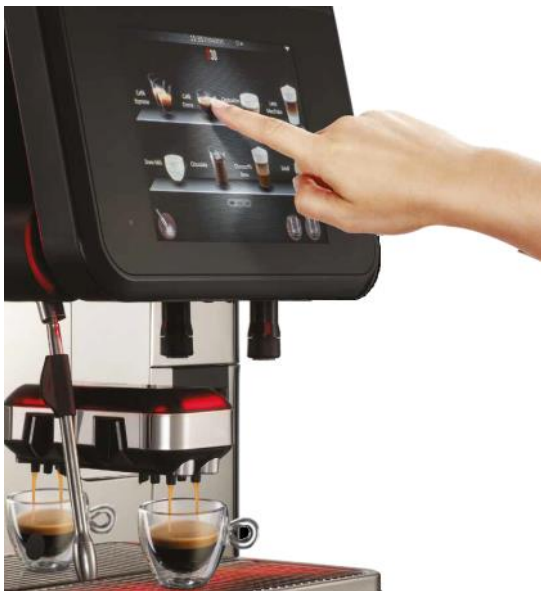
(S30-CS10 shown with optional standard steam wand)