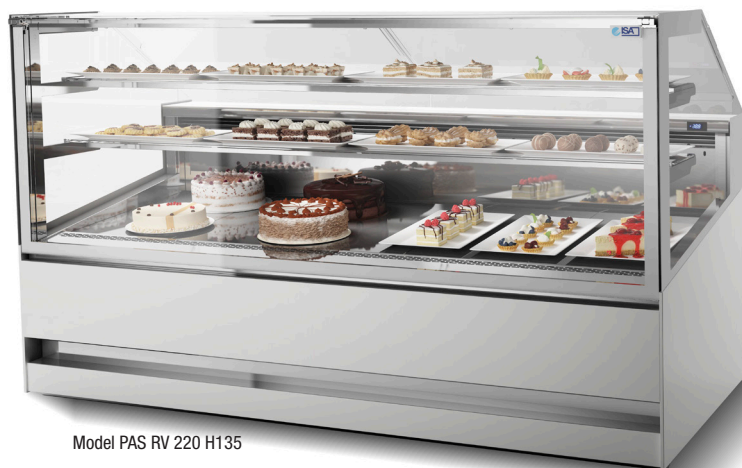
Model PAS RV 220 H135