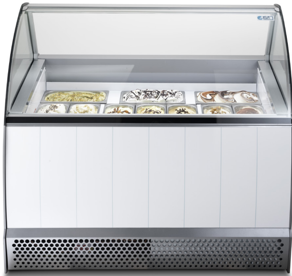
Model LX RV 10