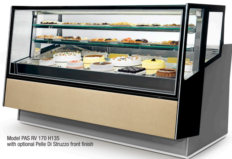
Model PAS RV 170 H135 with optional Pelle Di Struzzo front finish