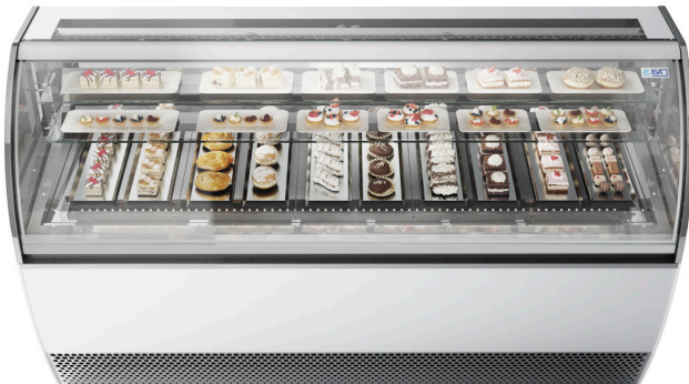
Model PAS LX RV 170