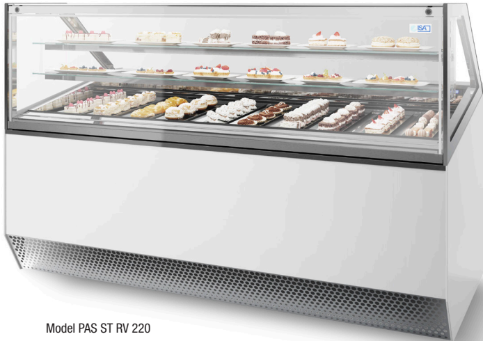
Model PAS ST RV 220