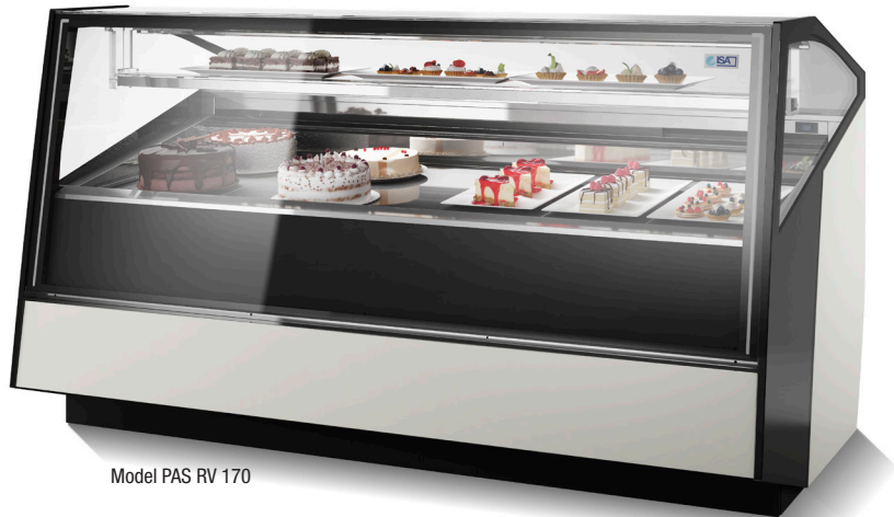
Model PAS RV 170