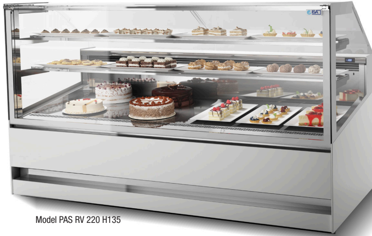
Model PAS RV 220 H135

Pastry display with all round visibility