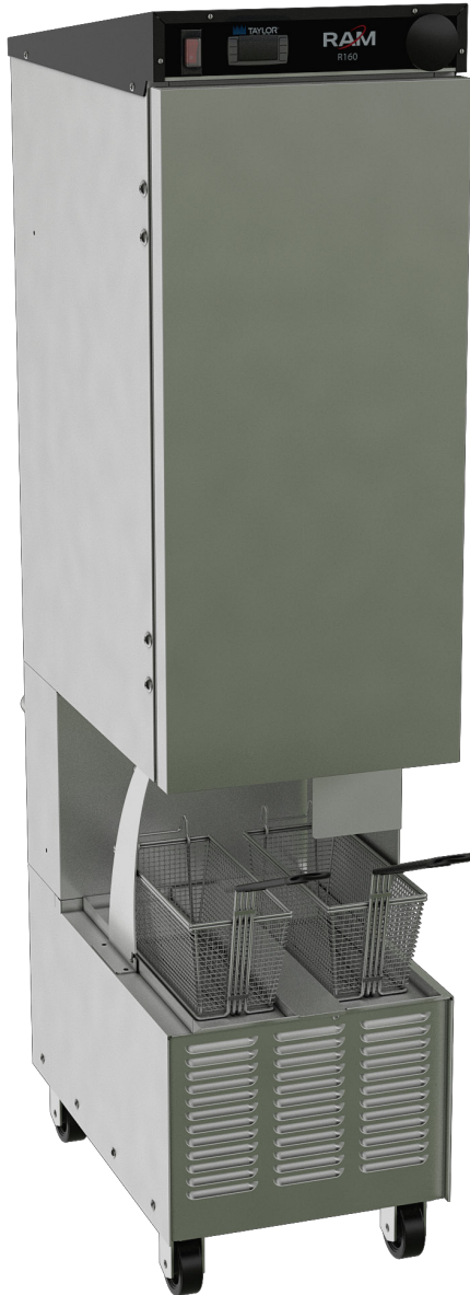
Fryer Baskets Sold Separately