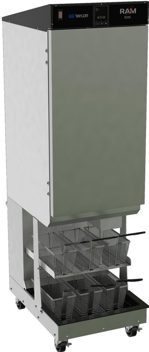
Fryer Baskets Sold Separately