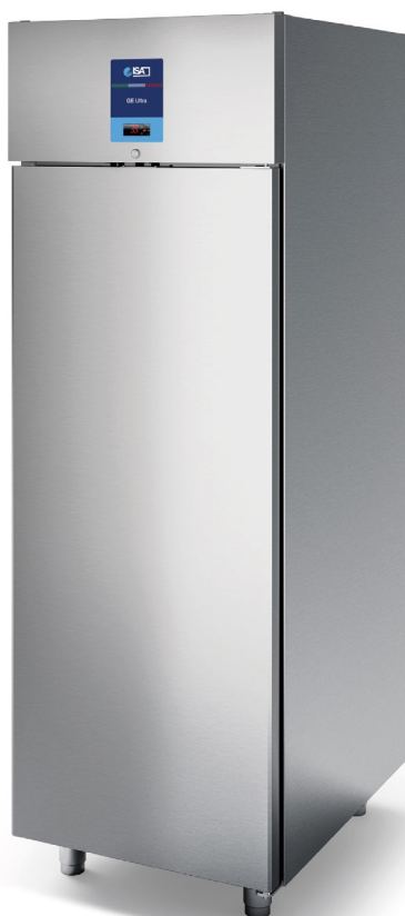
Model GE RV TB PLUS

Upright storage cabinet - chilled or frozen