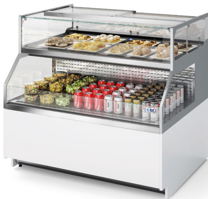
Model COMBI RV TN + RV TN - 100 H117