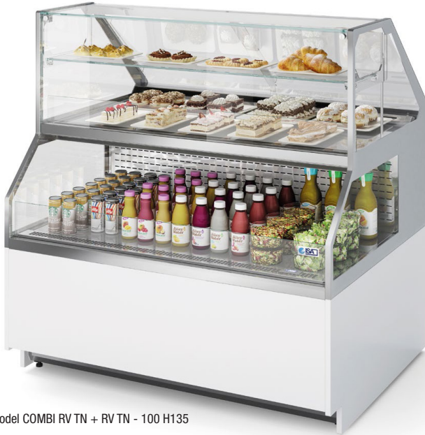
Model COMBI RV TN + RV TN - 100 H135