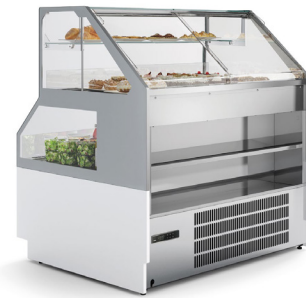
Model COMBI RV TN + RV TN - 100 H135 (REAR VIEW)

METRO COMBI - Split level self serve & assisted service display cabinet - chilled & heated