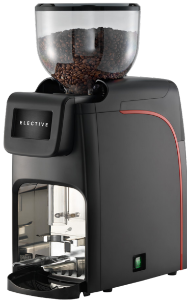
LA CIMBALI ELECTIVE