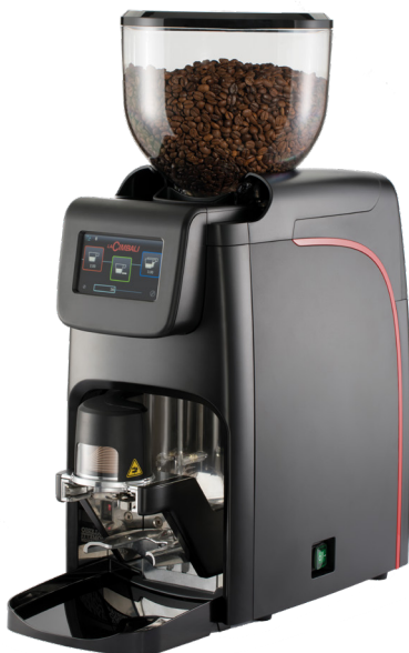
LA CIMBALI ELECTIVE AUTOTAMPER