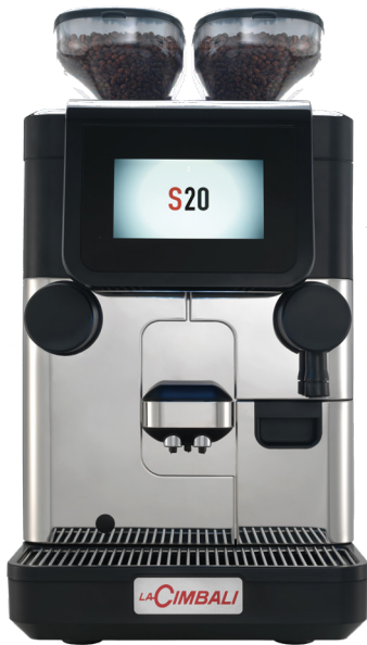
La Cimbali S20 CP11

Bean-to-cup coffee machine up to 200 cups per day