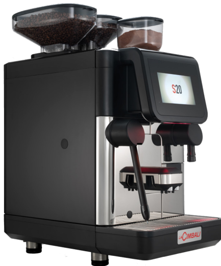
La Cimbali S20 CS10+TS4