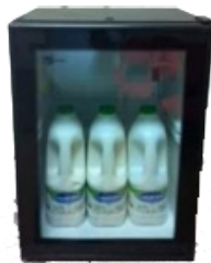
Vitro Under-Counter Fridge