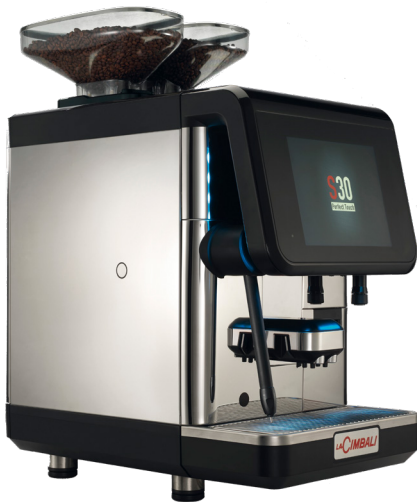
La Cimbali S30 CP10+TS4