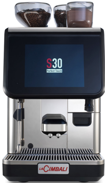
La Cimbali S30 CS10

Bean-to-cup coffee machine up to 300 cups per day