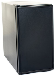
Vitro Counter Fridge