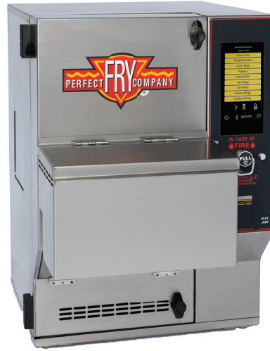
Robotic Loading & Dispensing - Digital Control - Heat Lamp Option Oil 2.75 US Gallons (11L)