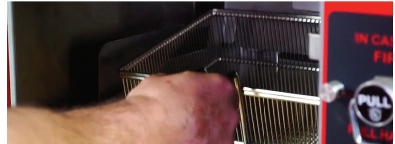
Basket Access Behind Door

**Production Capacities Vary Based on Product Cooked