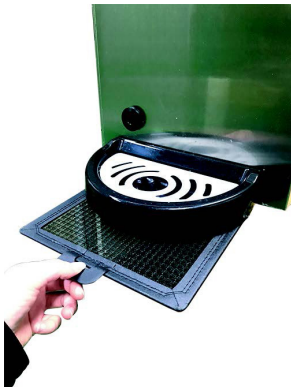
ISI-161TH Panel Air Filter