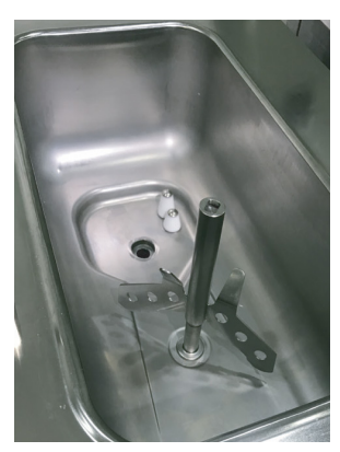
ISI-301TH hopper agitator