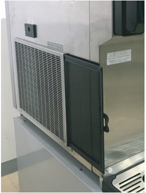
ISI-301TH Side Panel Air Filter